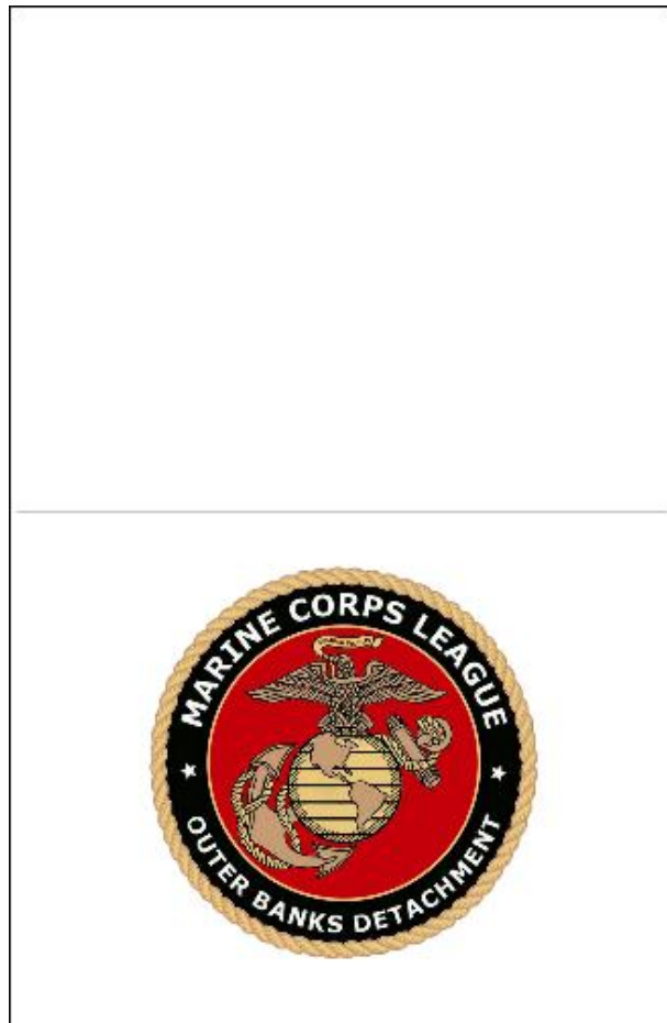
Outer Back and Front